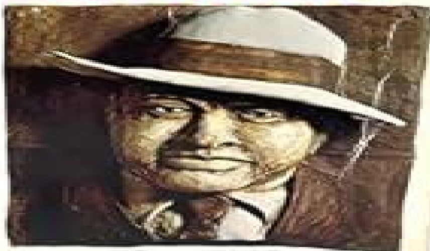
Al Capone (1899-1967)

Packed with photographs and illustrations.