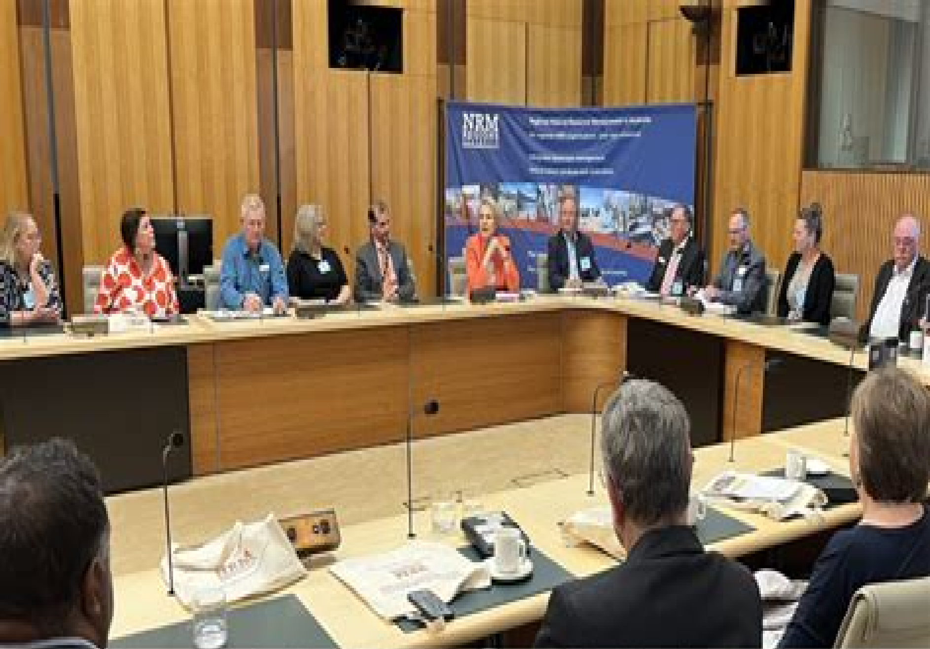
Minister for Environment and Water Tanya Plibersek, Shadow Minister for Environment, Fisheries and Forestry Senator Jonathan Duriam and other parliamentarians met with regional natural resource management Chairs last year to discuss the sector's needs.