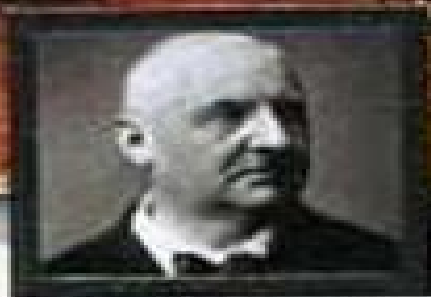
ANTON BRUCKNER (1824 - 1896)