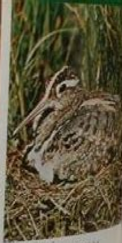
b. Pied-billed Grebe 225 mm Bill Fisher