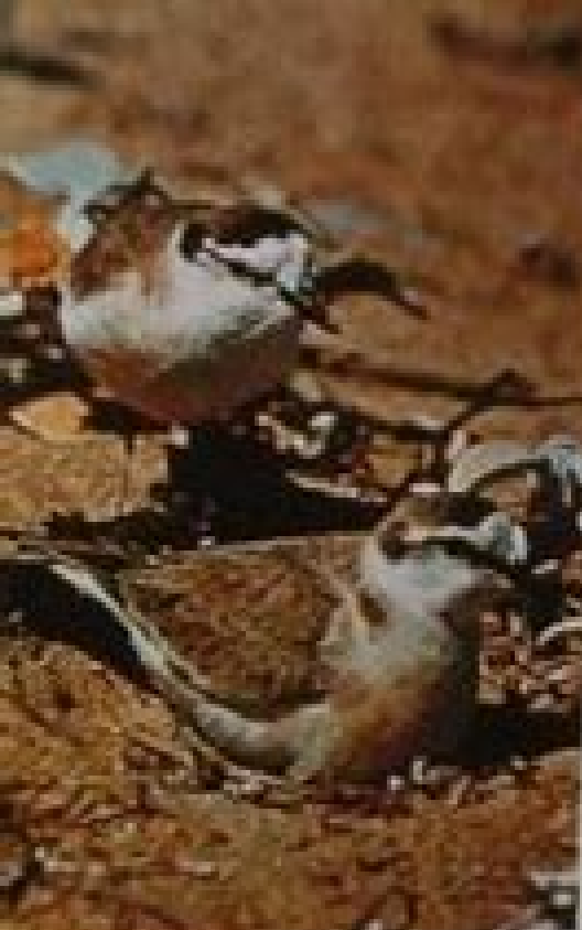
a. White-crowned Sandpiper 175 mm Garry McIlwain