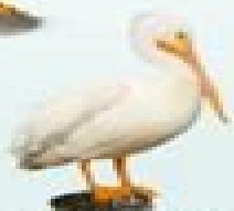
American White Pelican