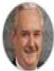
Lorenzo Zambrano CEO CEMEX