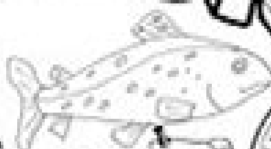
State Fish Arizona Trout