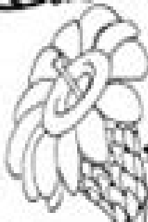
State Flower Saguaro Cactus Blossom