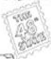
State Bird Cactus Wren