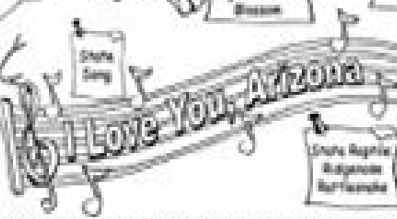
State Reptile Rattlesnake