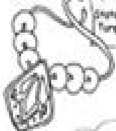
State Gem Turquoise