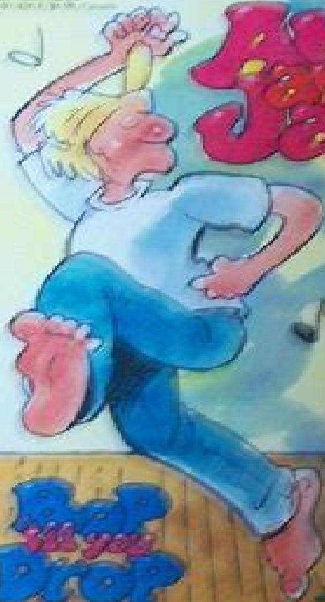
ILLUSTRATION BY JIMMY JOHNSON