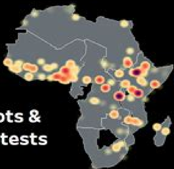
Riots & Protests