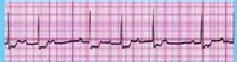
2nd degree AV block Mobitz 1