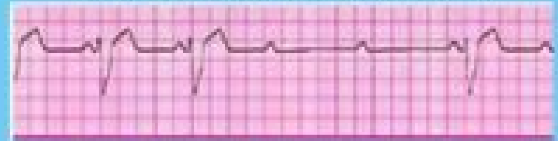
2nd degree AV block Mobitz 2