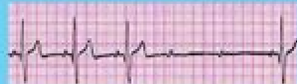
2nd degree AV block Mobitz 2