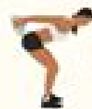
D. LATERAL RAISES