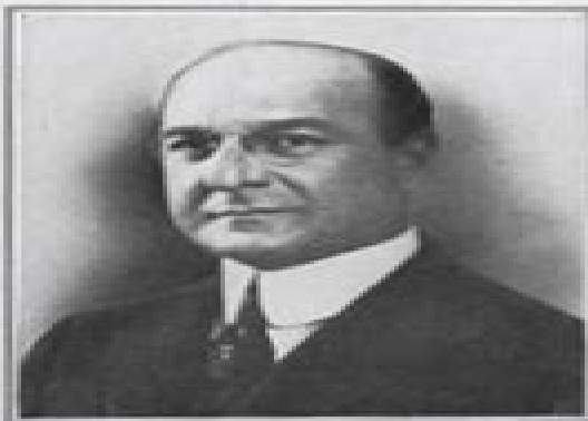
PIERRE S. DU PONT 1915 - 1919