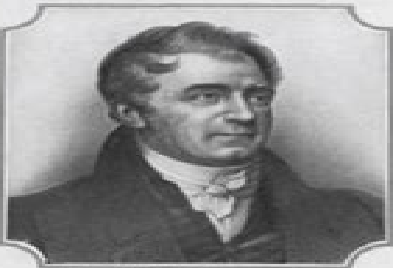
E. L. DU PONT DE NEMOURS 1802 - 1824