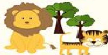
Lion Lion cub