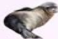
Hawaiian Monk Seal