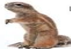
Arctic Ground Squirrel