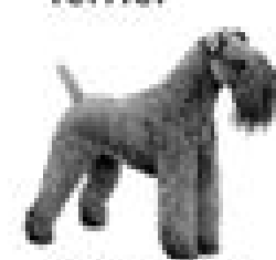
Kerry Blue Terrier