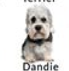
Dandie Dinmont Terrier