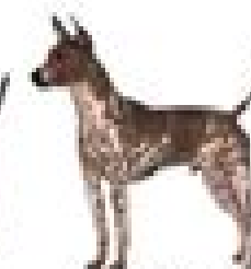
American Hairless Terrier