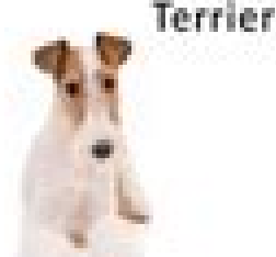
Wire Fox Terrier