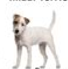
Parson Russell Terrier