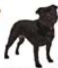
Staffordshire Bull Terrier