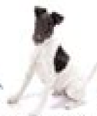
Smooth Fox Terrier