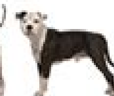
American Staffordshire Terrier