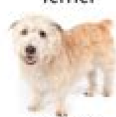
Glen of Imaal Terrier