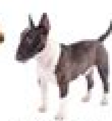
Miniature Bull Terrier