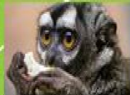
6. ANDEAN NIGHT MONKEYS