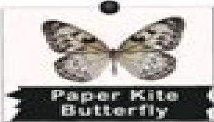
Paper Kite Butterfly