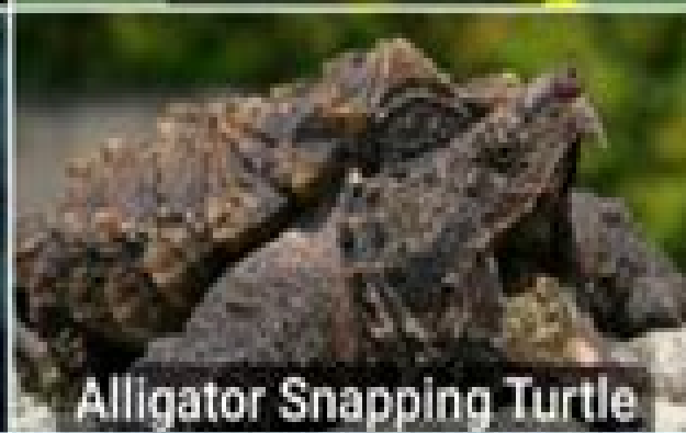
Alligator Snapping Turtle