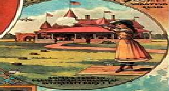
CORNER FIELD IN GREAT SHOOTING MATCH AT WHITEHALL PARK, N.Y.