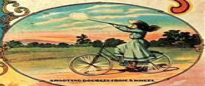
SHOOTING DOUBLES FROM A WHEEL.