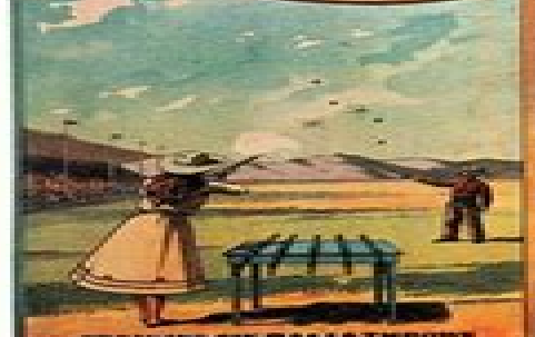
SHOOTING TEN BALLS THROUGH IN THE AIR AT ONE TIME.