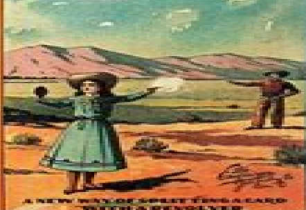
A NEW WAY OF SPLITTING A CARD WITH A REVOLVER.