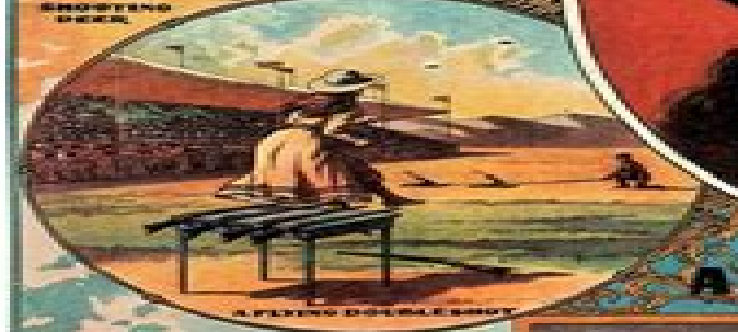
A FLYING DOUBLE SHOT.