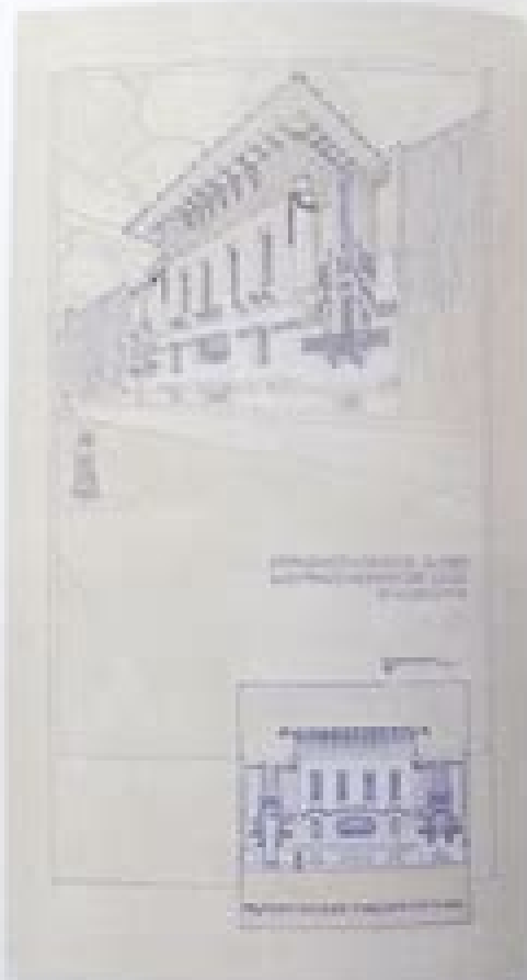
Architectural drawing of a building facade, likely a church or institutional building, featuring a prominent pediment supported by columns.