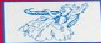
Water Theme Parks