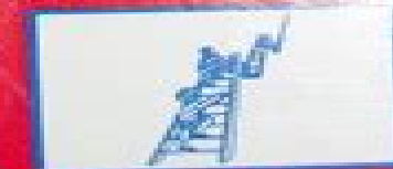
Activity Centers/ Indoor Playgrounds