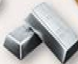
(All other metals)