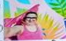
THE BRIGHT COLORED TROPIC POOL

THIS IS OFFICIALLY DAY ONE! THE SUPER COOL TROPIC POOL