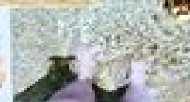
WARM-UP, TROPICAL WATER