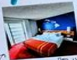
THE CRUISE FURN FROM ROOM