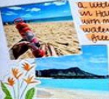
DIAMOND HEAD FROM WILKES

MY FAVORITE BEACH. IT WASN'T OVERLY BUSY & THERE WAS PLENTY OF SPACE TO PUT DOWN MY TOWEL & LAYOUT, WHICH IS EXACTLY WHAT I DID - ALL AFTERNOON & GOT BURNED