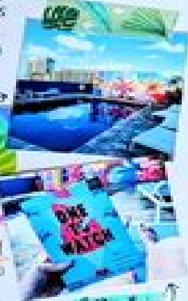
BOOK IT! TROPIC POOL