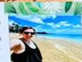
THE SUNSHINE! A LITTLE AWAY IN HAWAII WITH ME, & WATER'S FREE!

AFTER I RECOVERED FOR A LITTLE BIT AT THE HOTEL I SWIMMED SANDALS & GOODBYE WHERE PUBLIC BEACH ACCESS WAS OFF. I WENT! THAT'S HOW I CAME TO FIND FORT DEBUSHY PARK WHICH QUICKLY BECAME