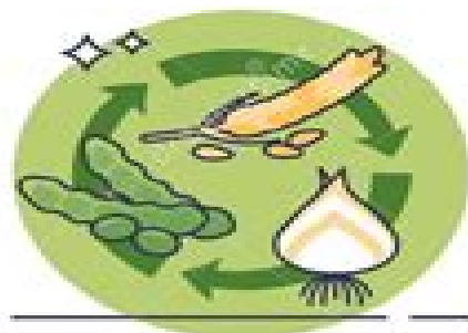
PRACTICING CROP ROTATION