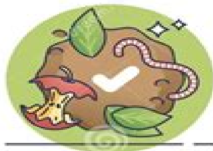
ADDING ORGANIC MATTER