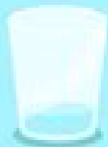
Not drinking enough water