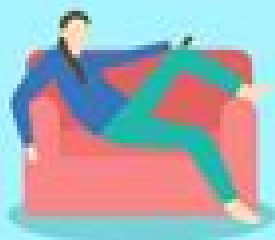
Lack of exercise