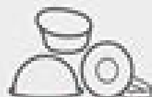
Cervical Cap, Diaphragm & Sponge EVERY TIME