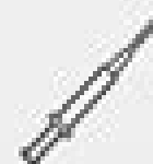
Injection 1-3 MONTHS