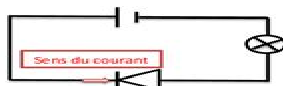
diode non passante

La diode laisse passer le courant électrique dans un seul sens.