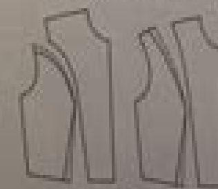
Decrease ease for a small bust

If an alteration is there is paper or fabric, the shoulder line or armhole curve must be marked and the waistline circumference adjusted.