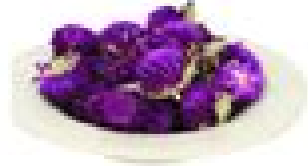
Gomphrena globosa L.