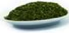
Mentha x piperita L.