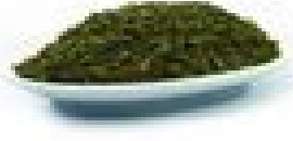
Mentha spicata L.