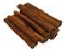
Cinnamomum zeylanicum Blame