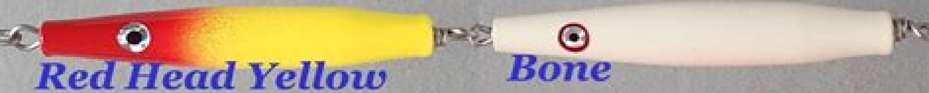
Red Head Yellow