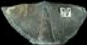
Brachiopod Mucrospirifer mucronatus