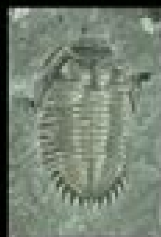
Trilobite Greenops boothi