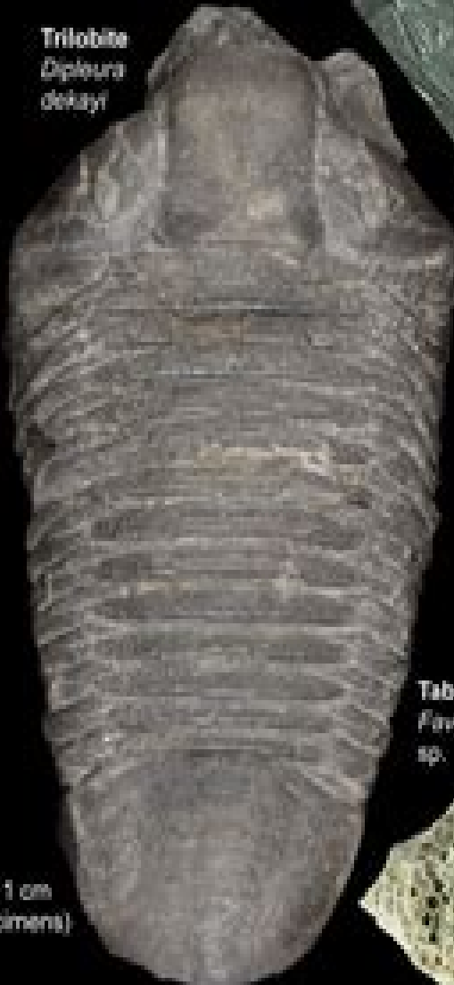
Trilobite Diploura delavayi