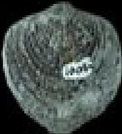
Brachiopod Spinatrypa spinosa