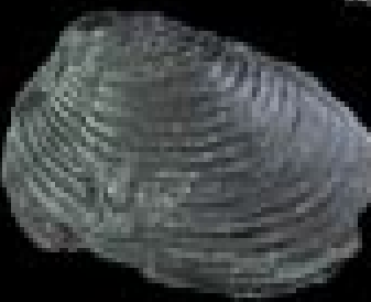
Bivalve Grammysa bisulcata