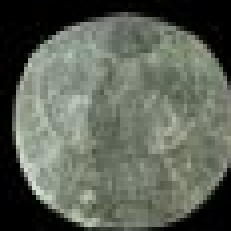
Brachiopod Rhipidomella penelope