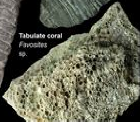
Tabulate coral Favosites sp.