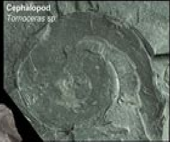
Cephalopod Tornoceras sp.