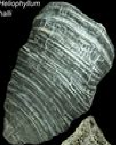
Horn coral Helioophyllum halli