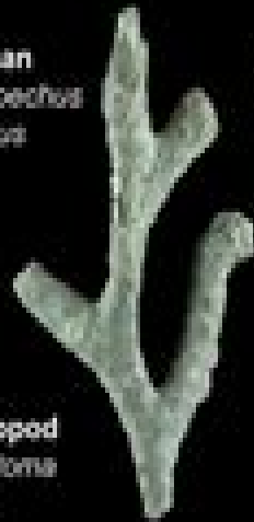
Bryozoan Atractoloechus fruticosus