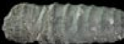
Cephalopod Spyroceras sp.