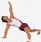
Floor exercise, men