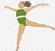
Floor exercise, women