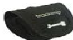
A Carrying Pouch