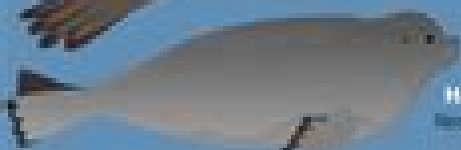
Hawaiian Monk Seal Neomonachus fro. phocaenoides 7 ft, 600 lbs