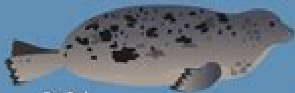
Gray Seal Hachyderme grypus attenuatus 10 ft, 860 lbs