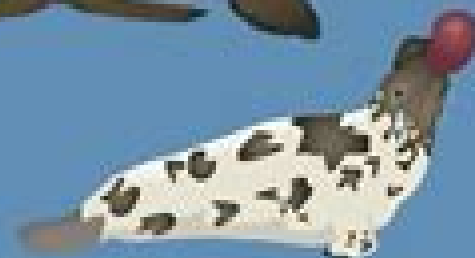
Hooded Seal ♂ Cystophorus cristatus 8.5 ft, 770 lbs