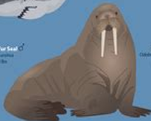
Pacific Walrus ♂ Odobenus rosmarus oblongus 12 ft, 4,000 lbs