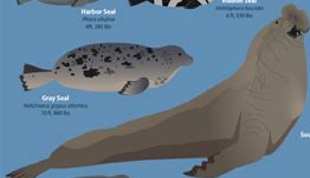
Southern Elephant Seal ♂ Mirounga leonina 20 ft, 8,000 lbs