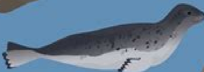
Leopard Seal ♀ Palfurus hepturns 11.2 ft, 1,100 lbs