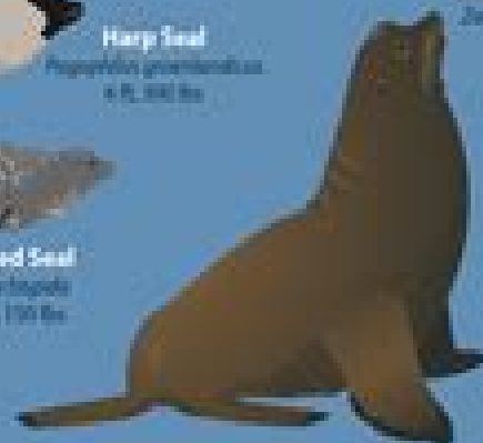
California Sea Lion ♂ Zalophus californianus 7.5 ft, 700 lbs