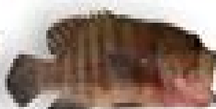
Chocolate Hind Cephalopholis boenak Maturity Length : 12 cm