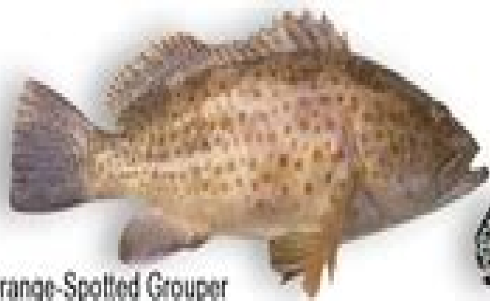
Orange-Spotted Grouper Epinephelus coioides Maturity Length : 25-30 cm Transitions : 55-75 cm