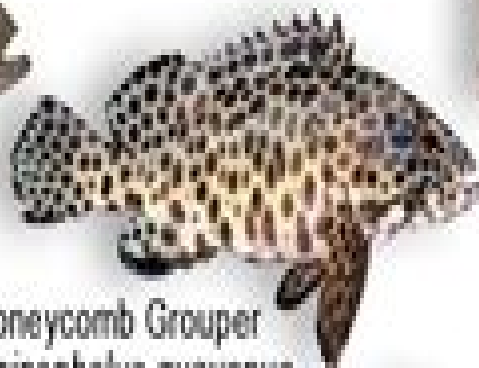
Honeycomb Grouper Epinephelus quoyanus Maturity Length : 24 cm Transitions : 33 cm