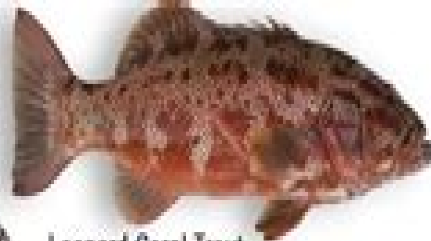
Leopard Coral Trout Plectropomus leopardus Maturity Length : Unknown