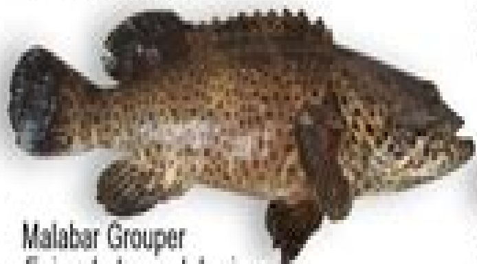
Malabar Grouper Epinephelus malabaricus Maturity Length : 58-64 cm Transitions : 10 years old