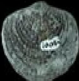
Brachiopod Spinatrypa spinosa