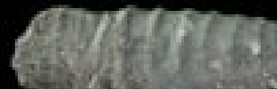
Cephalopod Spyroceras sp.