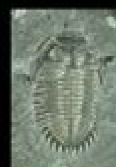
Trilobite Greenops boothi