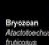
Bryozoan Atactoloechus fruticosus