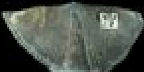
Brachiopod Mucrospirifer mucronatus