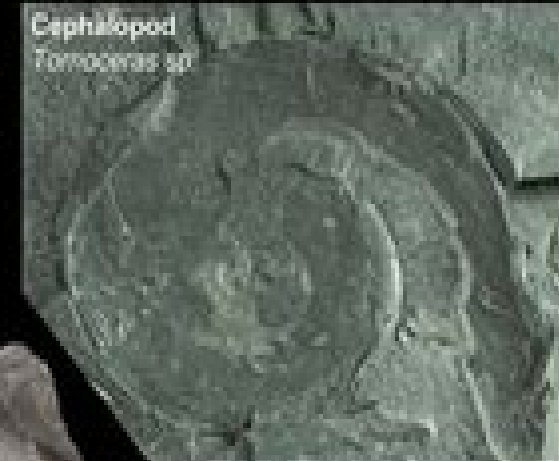
Cephalopod Tornoceras sp.