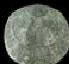
Brachiopod Rhipidomella penelope