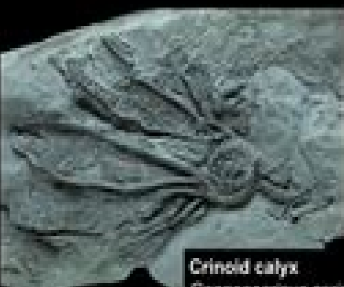
Crinoid calyx Gennaeocrinus carinatus