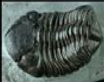
Trilobite Eldredgeops rana