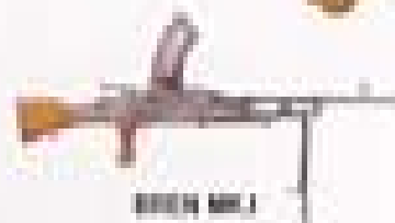
BREN MK. I