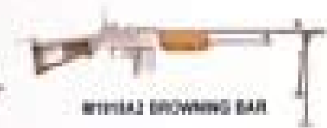
M1919A2 BROWNING BAR