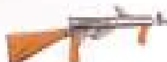
STEN MK. IV