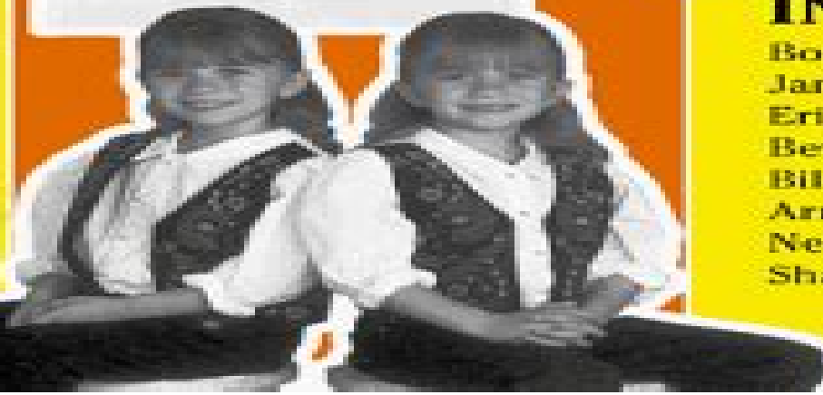
Ashley and Mary-Kate Olsen

Joe Montana Mary-Kate and Ashley Olsen Jack Prelutsky Richard Scarry Dr. Seuss Emmitt Smith