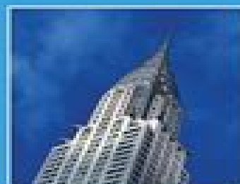
Chrysler Building, New York