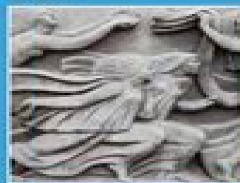
Plaque des Champs Elysees Japan, Antoine Bourdelle