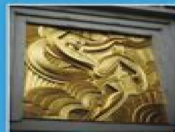
Pablo Picasso, Paris