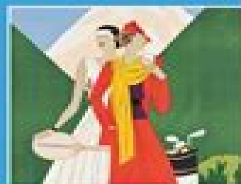
Vintage travel poster