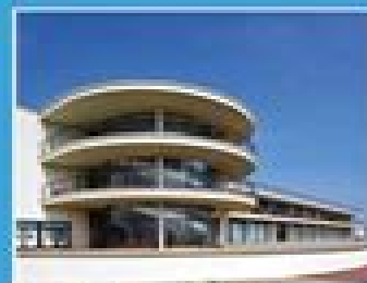
De La Warr Pavilion, Bexhill