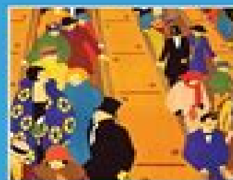
London Underground poster, Horace Taylor