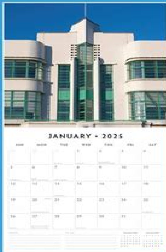
Illustration: Wells Street & Taylor