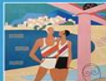
Monte Carlo Beach poster, Michel Bouchaud