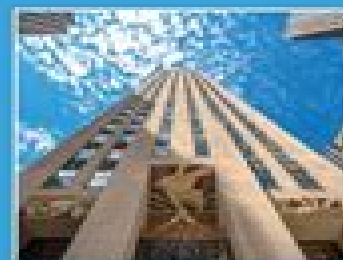
Rockefeller Center, New York