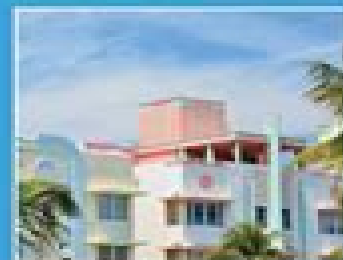
Art Deco style architecture, Miami