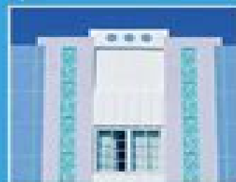
Hotel on Ocean Drive, Miami