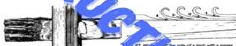
Fig. 28. Working off the back of the bone with the draw knife. Note the smooth curve along the blade.

Fig. 24 Using the shoe knife to make tapping cuts for the handle recess while the shoe is being held in a vise. Lower angled, shallow cuts will be used for the ends of the handle.