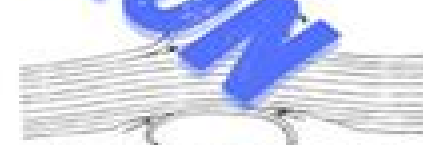
Fig. 28. Angle of the blade as the stress profile cuts through a growth ring in the sapwood of an Oregon