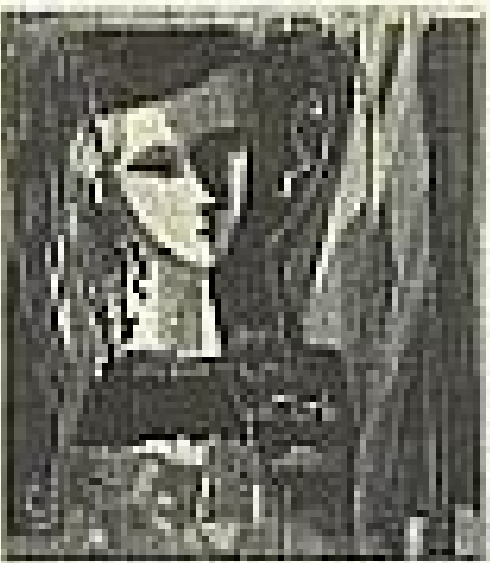
Illustration of a wall hanging by the artist, John