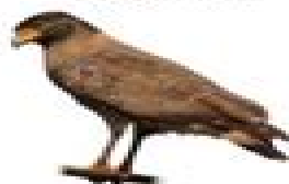
Crested Serpent Eagle