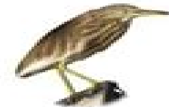
Indian Pond Heron