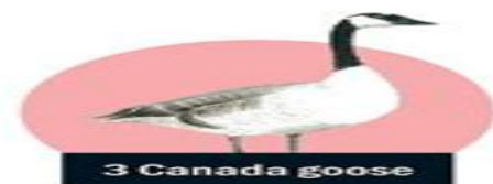
3 Canada goose