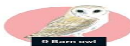
9 Barn owl