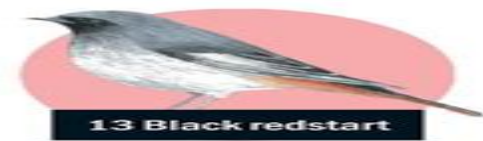
13 Black redstart