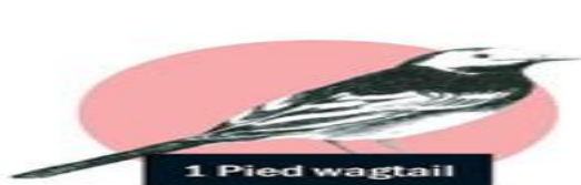
1 Pied wagtail