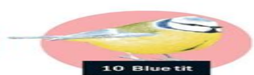
10 Blue tit