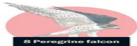
8 Peregrine falcon