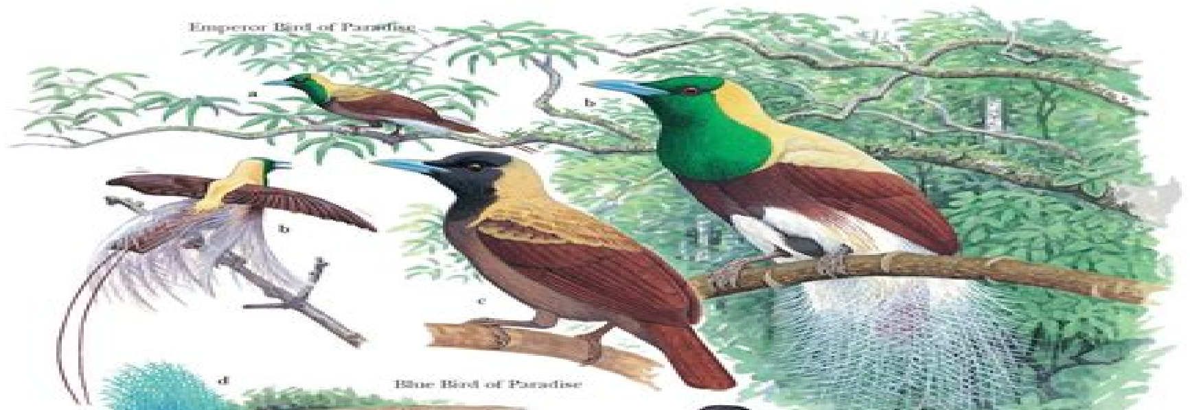
Blue Bird of Paradise