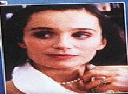
Kristin Scott Thomas