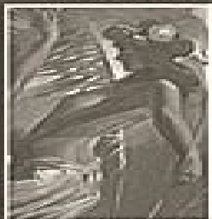
Wm. Russell Flint