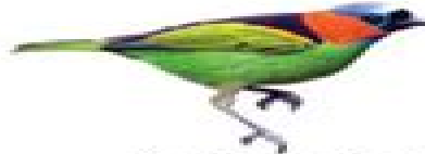
Red-bearded Bee Eater