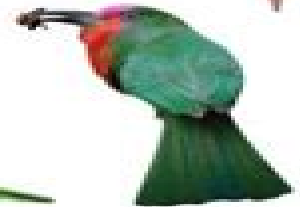
Red-bearded Bee Eater