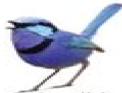
Splendid Fairy Wren