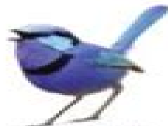
Splendid Fairy Wren