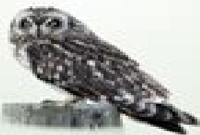
Hawaiian Short-eared Owl